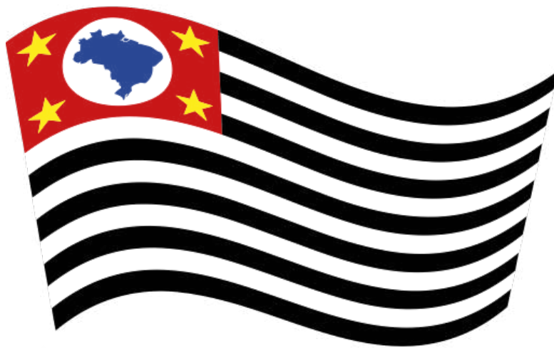
FLAG SÃO PAULO CITY