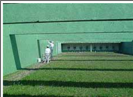
Gong Si Shooting Range - 50m

And there would be another short technical meeting at Cong Si Rifle Range, to welcome and meet the International Shooting Judges.