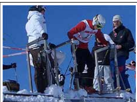
Ski cross participant lines up at the gate