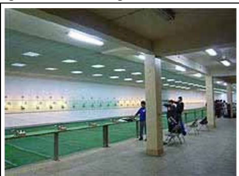
Gong Si Shooting Range - 10m

There would be a technical meeting on Friday 4 September from 10:00 until 12-30 pm at Gong Cheng Complex, Room 2F-100B and there would be 15 Jury Members