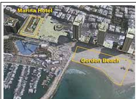
Aerial view of 2010 World Deaf Beach Volleyball Championships

Beach Gordon is one of the veteran popular beaches in Tel Aviv. This beach serves many tourists from the adjacent hotels and close