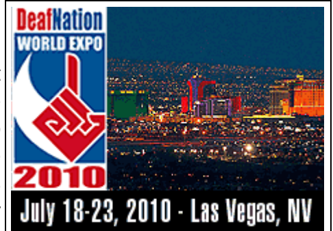
Logo - DeafNation World Conference & Expo