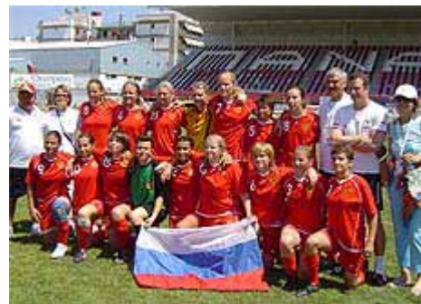
Russian Federation - 2008 World Deaf Football Women's Champions

A total of 130 athletes from 22 countries attended. Altogether there were 17 men's and 10 women's teams. Due to the great achievements of all countries we can contently look forward to the future and look for additional success.