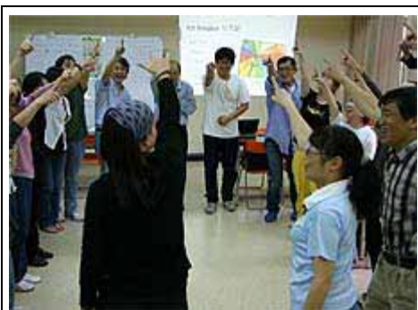
Volunteers gather together for ice breaking session