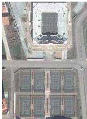
Bird view at the Tennis Center