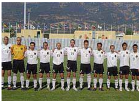
Germany - 2008 World Deaf Football Men's Champions

I have to say that there were many problems with the referees because often times they didn't referee neutral and impartial. In future we should be willing to employ the best and most experienced referees. Likewise we have to guarantee safety in the stadium for all athletes and fans.