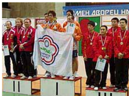
Top 3 podium finisher for men's team event in Sofia, Bulgaria

By now we are finished with our 1st World Deaf Table Tennis Championships that went well in Sofia, Bulgaria, with 130 athletes from 27 Countries. Thanks to the Bulgarian Deaf Sports Federation for hosting this event.