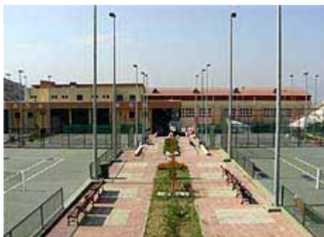
View at the Tennis Center with the courts and the building from the frontside of the Arena