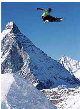
Snowboarder catch big air

Starting from Norway to the North American hemisphere, summer comes again after the long bitter winter. Making its way to the Southern hemisphere, such as in New Zealand, the Summer Camp offers an opportunity to learn new tricks and practice style in snowboard. But the future looks bleak. The global temperature rises steadily, triggering the attack on the glacier. The reduction of carbon dioxide emissions does not appear to be in sight. In some fifty years, the eternal ice in the Alps will finally disappear, according to the forecasts of the climate experts. But there is still enough time for surfing on the mountains. Be careful about your personal carbon dioxide amount and let yourself enjoy a car ride occasionally, soaking in the sights of the elegant summer glacier.