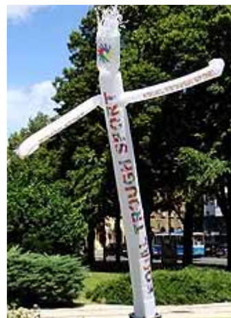
Deaf Sports Reform Flying Body

With the change in bidding procedures approved during the Congress in Salt Lake City, I took advantage by meeting and discussing with city and government officials in Barcelona and Dubai to gauge their interest in hosting the 2017 and 2021 Summer Deaflympics respectively. I am