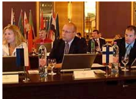
Delegates listens carefully

pleased to confirm that both cities have expressed genuine interest and intent to prepare a formal bid with the ICSD to host the Games. For more information about Barcelona visit http://www.barcelona-tourist-guide.com/en/albums-en/olympic-stadium/pages/olympic-stadium-01_jpg.html and http://www.inefc.net . For Dubai, go to http://www.dubaisportscity.ae