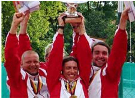
2007 Dresse Cup Winner – Austria