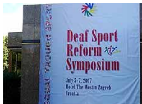
Deaf Sports Reform Banner