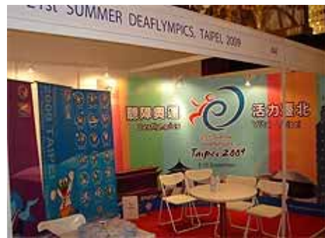
2009 Summer Deaflympics booth at SportsAccord

in Athens / Greece. This would be a great advertisement for our deaf sports world.