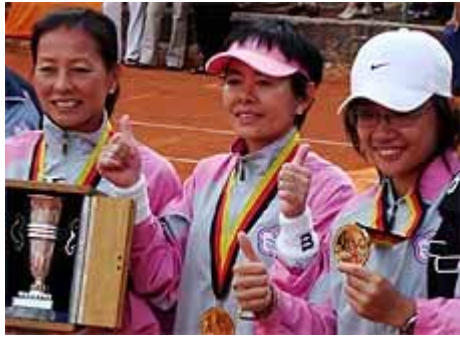
2007 Maere Cup Winner - Chinese Taipei