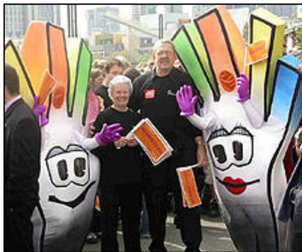
Mascots Celebrating 100 Days to Go Celebration

They also launched the Cultural program by playing an attractive promotional video. All of the local media attended, it was a fantastic event and it heralded that last big public event before the Opening Ceremony!