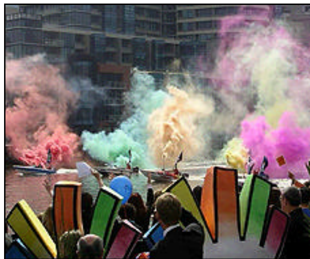
Explosive M2005 Colors celebrating 100 Days to Go!

To celebrate the 100 Days to Go event, Melbourne Organizing Committee and the local community had a morning of celebration across Melbourne.