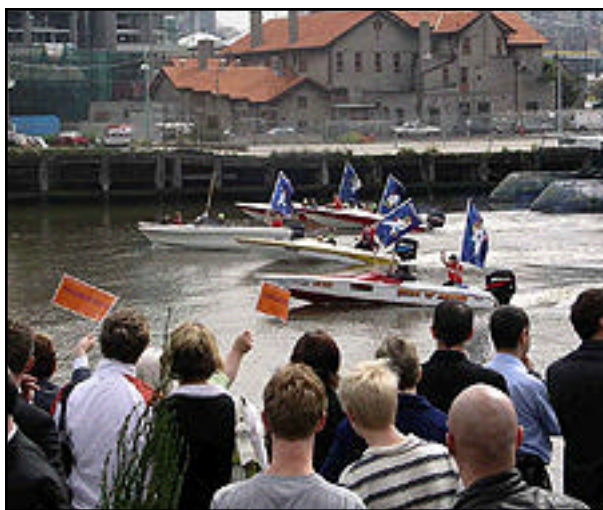
Boats waving M2005 Flags.