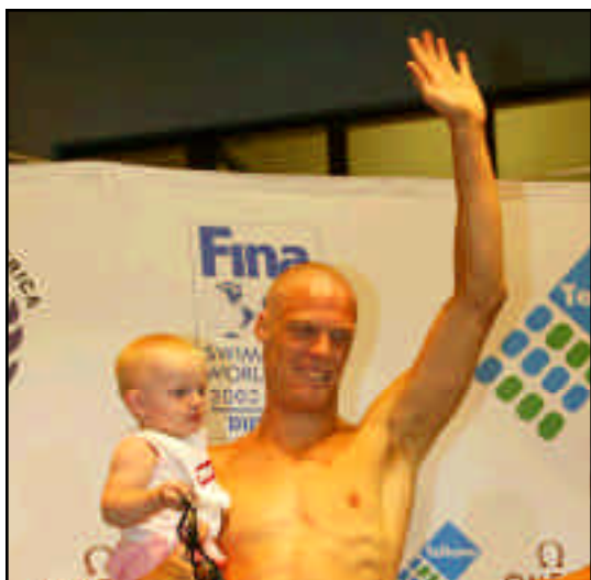
Terence and daughter