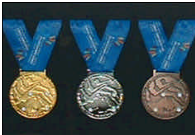
2005 Deaflympics Medals were presented at the event!

Here are some additional photos that were taken from the One Year to Go Count Down Celebration event in Melbourne. Please check out the event of the the Celebration at http://www.deaflympics.com/mel2005/newsandmedia_1ytg.asp .