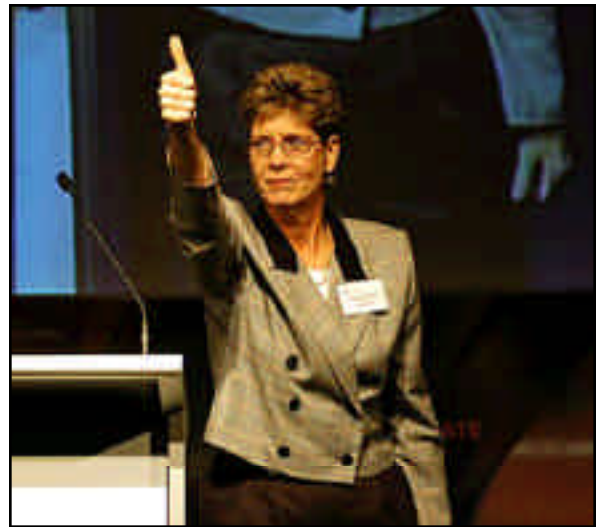
Thumbs Up to M2005!

I still feel very upbeat from my recent site visit to Melbourne, Australia from 3 to 9 January. The mission statement of the 2005 Organizing Committee (better known as M2005) is that they will stage a world class sporting and social event for Deaf and hard of hearing athletes and friends around the world. Yes, they will, I can assure you! You should really consider about attending the Games next year. If you miss it, it will probably be one of the biggest regrets you will have.