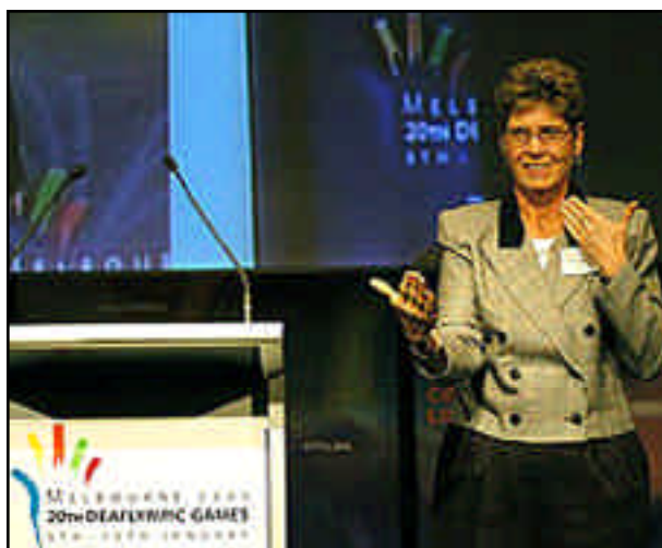
Count Down Celebration in Melbourne