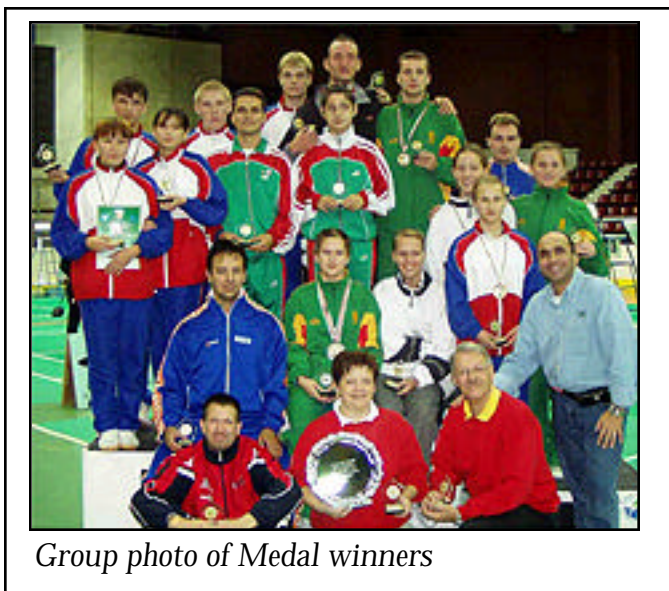
Group photo of Medal winners

Held in Sofia, Bulgaria 20-28 October 2003